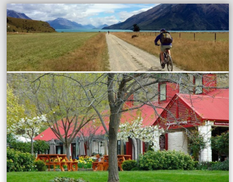
CYCLE ARROWTOWN TO GIBBSTON WINERY

The heart of its history is Buckingham Street, a procession of small town heritage buildings that stretch into a tree lined avenue of tiny miners' cottages. It is a wonderful place to browse and relax, enjoying the shopping, and soaking up Arrowtown's lively heritage.