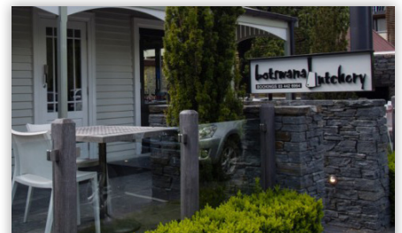
DINNER AT BOTSWANA BUTCHERY

Soaring above Queenstown's scenic Wakatipu Basin, soak in the scenery as you enjoy the ride. Your paraglide adventure begins when you take off from an obscure location and then fly for about 5 kilometres over farmland and a smattering of houses dotting the area, finally returning to land at a landing zone specially designated for paragliders.