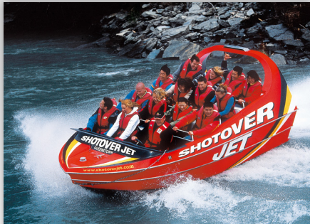
OPTIONAL ACTIVITIES; 4WD, SHOTOVER JET

Four Wheel Drive Safari with Nomad Safaris NZ$150 - $255pp* (approx USD$100-$171pp*)