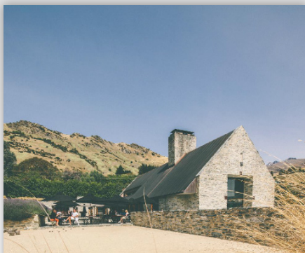
LUNCH AT AMISFIELD

On arriving in Queenstown, your luggage will be dropped off to your room at The Rees while you are taken straight to lunch at Amisfield winery and bistro.