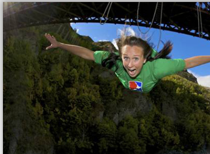
OPTIONAL ACTIVITIES; KAWARAU BRIDGE BUNGY, PARAGLIDING

Kawarau Bridge Bungy with AJ Hackett Bungy NZ$195pp* (approx USD$131pp*)