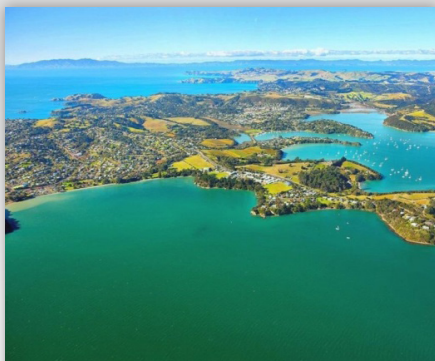
FERRY TO WAIHEKE ISLAND AND LUNCH AT STONYRIDGE VINEYARD

Waiheke Island is the ultimate island retreat. You'll feel another world away, and yet Waiheke is just a 35-minute ferry ride from downtown Auckland. Known as the island of wine for its many wineries and vineyards.