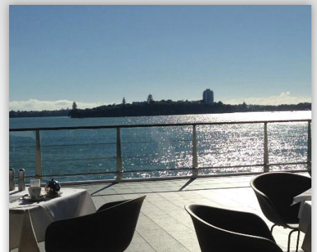
DINNER AT FISH SEAFOOD RESTAURANT

Nestled in a shimmering valley of olive trees, colourful vines, and the aromas of the south of France, the Veranda Restaurant is one of the most romantic and exotic venues in New Zealand for dining.